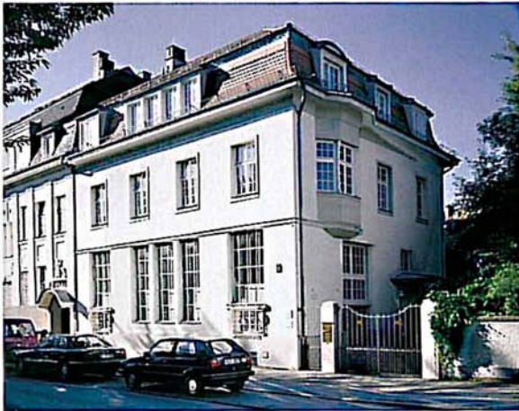
The premises of Alexander Tutsek-Stiftung, Munich